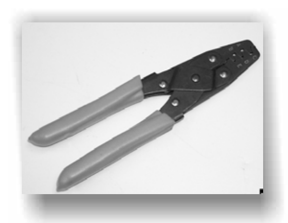
Single wire crimp tool. Used for smaller gauge terminals. p/n 500518.....$45